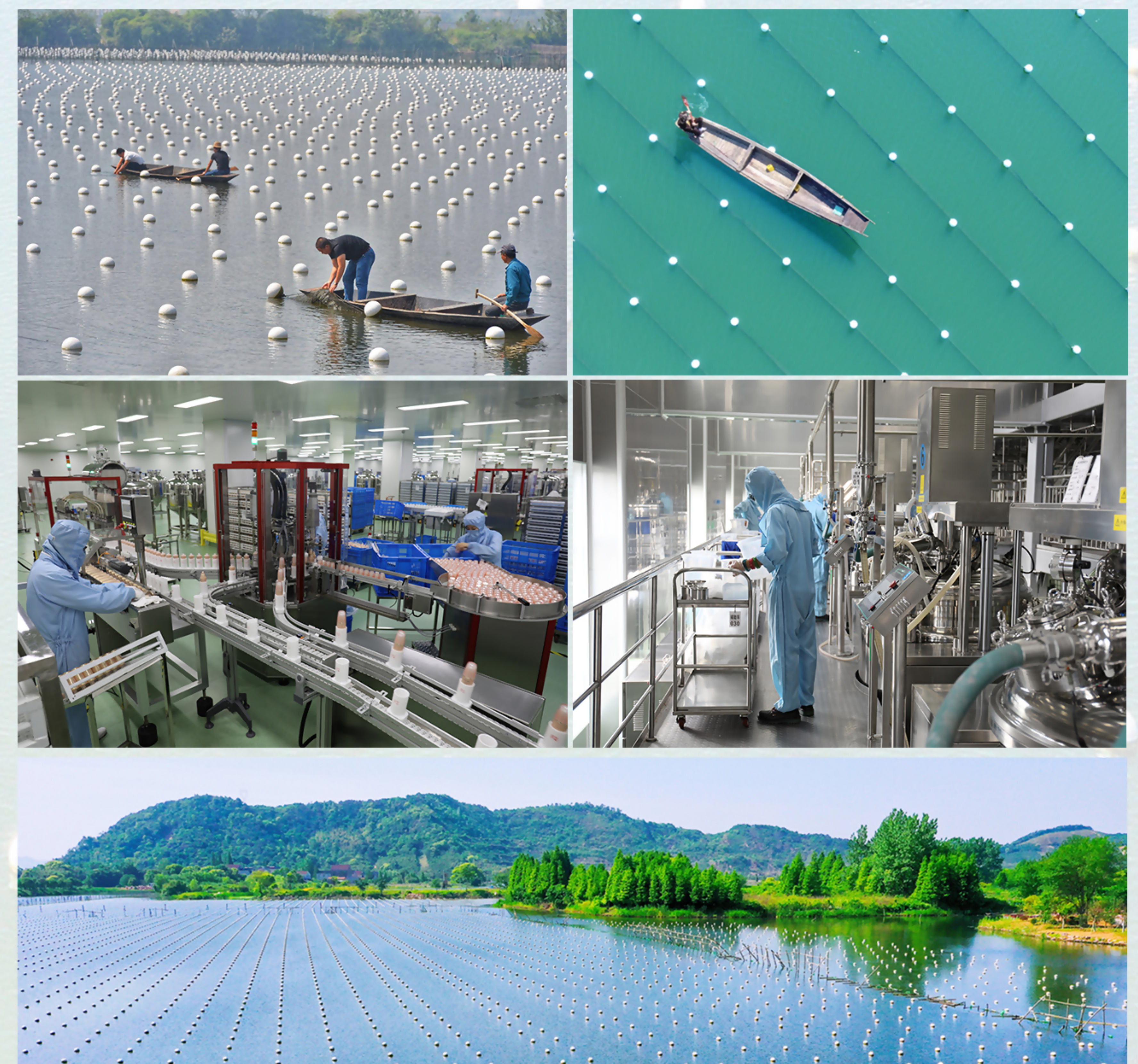
Freshwater pearl mussels' cultivation and processing

China is the largest freshwater pearl export country in the world, whose yield accounts for 90% of the global pearl yield. Deqing Freshwater Pearl Mussels Composite Fishery System owns the complete industrial chain from clam culture to end pearl product processing. The clam meat is edible and delicious. The clam shells can be processed into various accessories and jewelries. The processing of pearl accessories further promotes the benign circulation of the whole pearl industry. At present, the clam culture areas using Deqing Freshwater Pearl Mussels Composite Fishery System are about 5,000 Mu with almost 3,000 practitioners, employment positions in the upstream and downstream industries over 30,000, annual output values of pearl culture and deep processing over 7 billion Yuan, and total amount of pearl deep processing over 100 tons, accounting for about 10% of the total yield of national freshwater pearls, making Deqing the largest pearl deep processing base in China, even in the world.