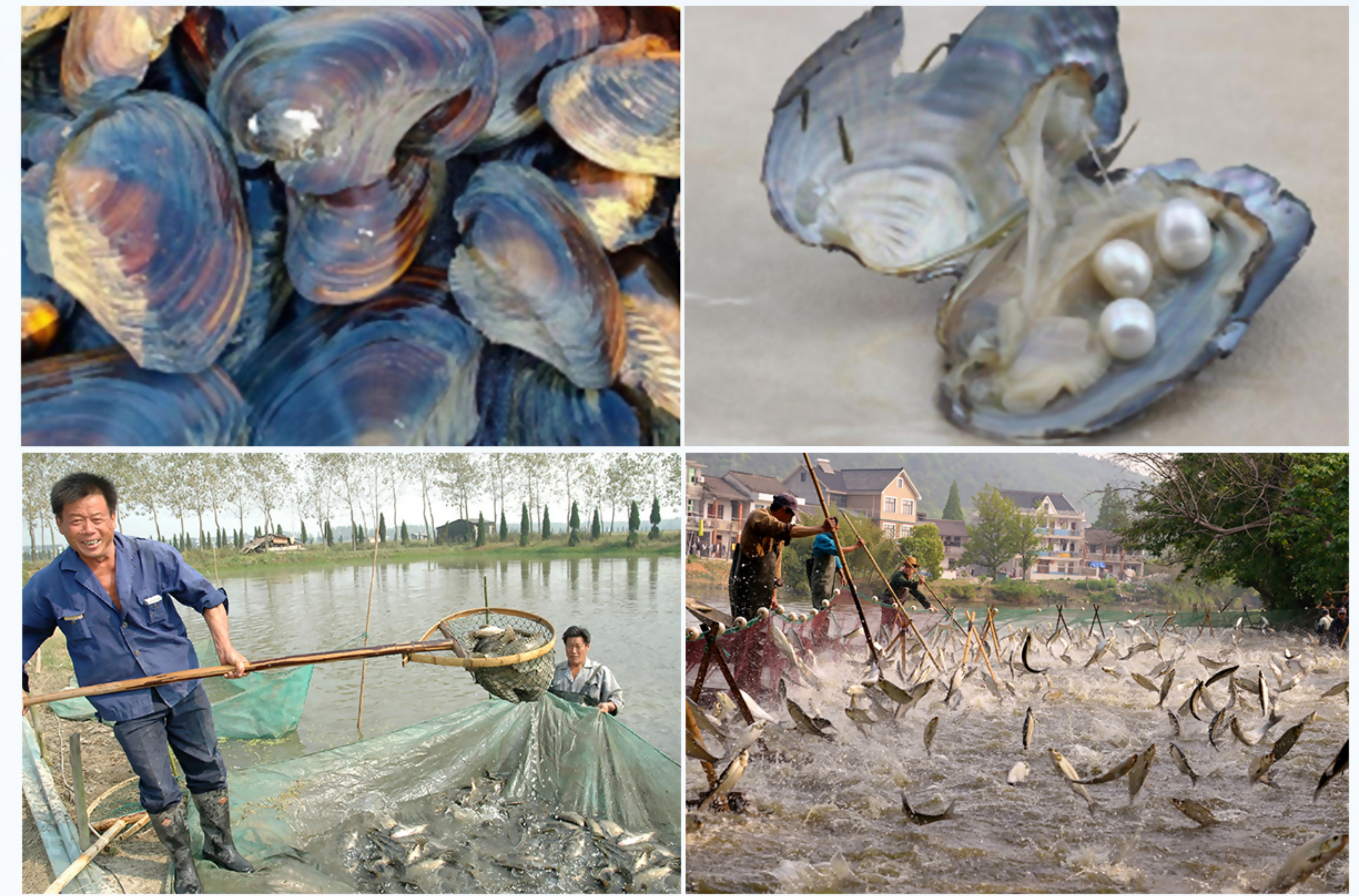
The scene of catching freshwater fish and the species of freshwater pearl mussels in Deqing County

Historically, the Deqing Freshwater Pearl Mussels Composite Fishery System's locale is the cradle of China's freshwater fishery culture and global mussel pearl cultivation techniques. In the long history process, abundant freshwater fishery species resources have accumulated there, including the clams for pearl culture, such as Cristaria plicata , Hyriopsis schlegeli , Anodonta woodiana , Anodonta woodiana pacifica , Hyriopsis cumingii , Lamprotula Lei and Lamprotula rochechouarti , as well as the fish species for freshwater fishing and aquaculture, such as silver carp and other plant-eating fish, Aristichthys nobilis , Hemibarbus prognathous , Mylopharyngodon piceus and other animal-eating fish, as well as Carassius auratus , Cyprinus carpio , Gnathopogon taeniellus and other omnivore-fish. As the freshwater fishery species resource pool in East Asia, such abundant species resources are of vital importance to the protection and development of freshwater fishery diversity.